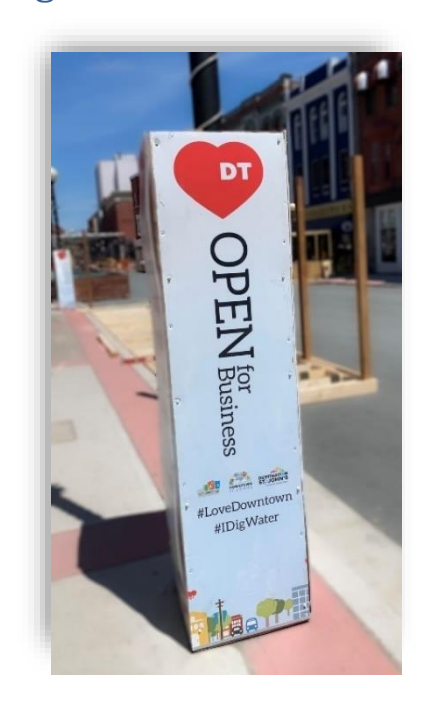
Page 8 of 8