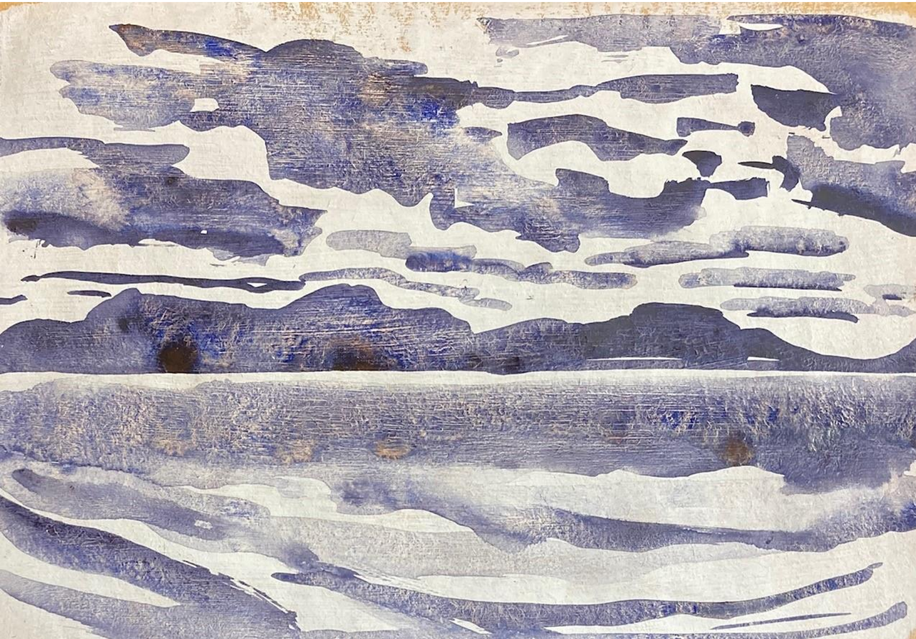
Deeley, Lori Grand Lake Watercolour