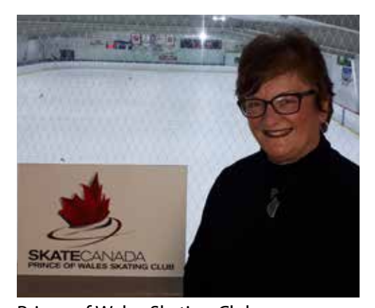
Prince of Wales Skating Club