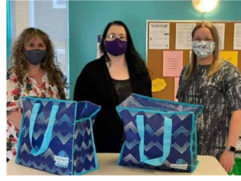
Staff and volunteers from Buckmaster's Circle Community Centre.

Along with other community and neighbourhood centres, Buckmaster's Circle Community Centre offers a broad range of programs and services to meet residents' needs. In doing so, it serves as a hub for residents to build new skills and knowledge, as well as to establish new social connections. Catherine's initiative provides just one of many examples of