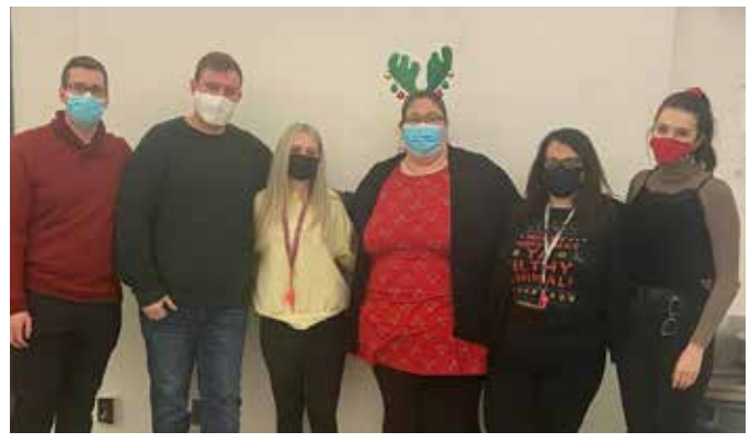
Boys and Girls Club