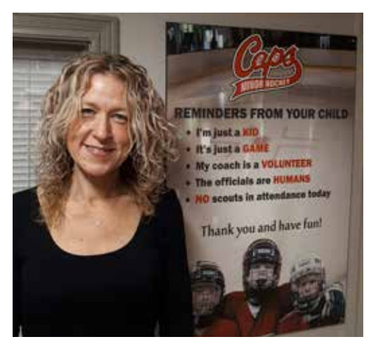
St. John's Minor Hockey Association (Caps) Sportscraft Source for Sports