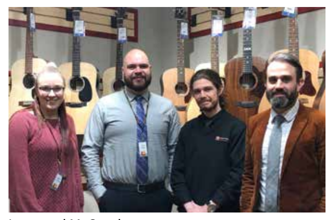
Long and McQuade