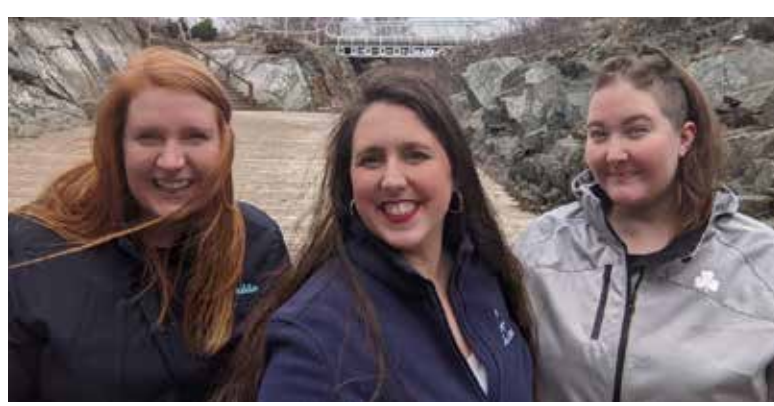
Girl Guides of Canada